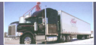
Bartel Bulk Freight Inc. Continued Expansion