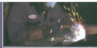
Norstar Industries Ltd. Innovative Ag Equipment