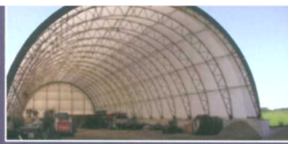
HiQual Engineered Structures Ltd. Pre-engineered Buildings