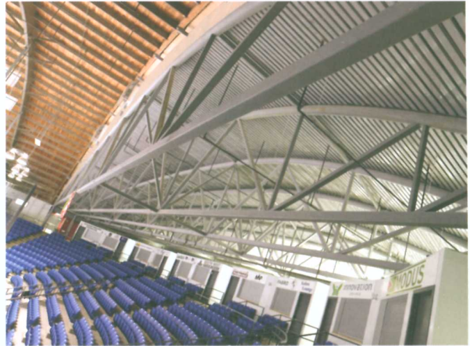
Credit Union iplex, Swift Current, Saskatchewan

As a LEED® certified builder, Graham has successfully delivered many projects with stringent LEED® requirements.